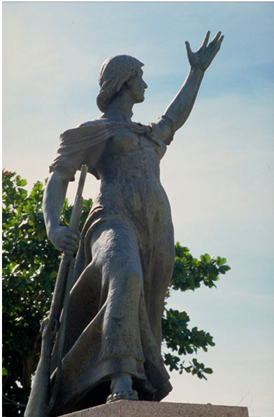
Estátua Museu Anita Garibaldi, Laguna-SC