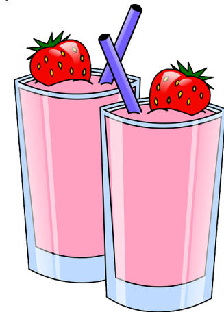
VITAMINA DE MORANGO