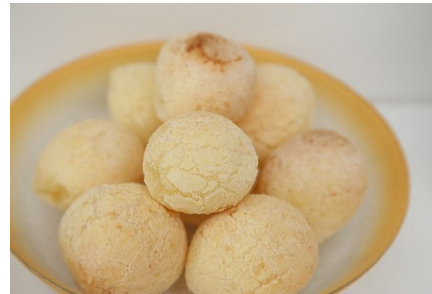
PÃO DE QUEIJO